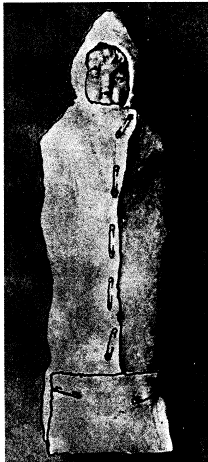
Making a "simple and cheap winter wrap and hood for a young baby," an illustration from the first edition of "Infant Care."