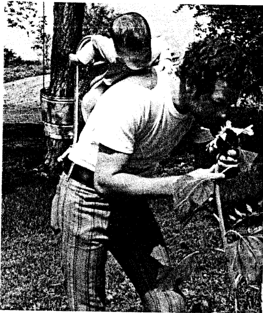
Far left: Making a baby's bed from a clothes basket (total cost: $3.15), from the first edition of "Infant Care." Left: illustration from "Infant Care" (1980).