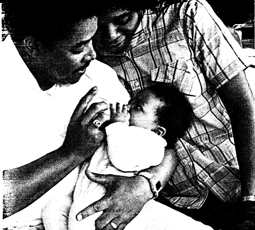
Two illustrations from the 1980 edition of "Infant Care."

the Children's Bureau undertook: a study of why babies died. For two years the 15-member Bureau staff gathered information on infant mortality in the United States, in a study that was the first of its kind undertaken by any nation. As Julia Lathrop, first Chief of the Children's Bureau, explained in a speech before the 9th National Conference on Child Labor in Jacksonville, Florida in 1913: