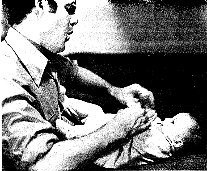
Illustration from the current edition of "Infant Care."

schedule of recommended immunizations and check-ups.